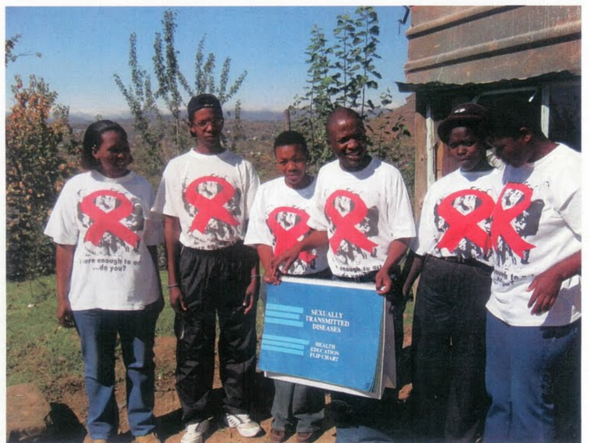
Right: Volunteers at the Sentebale day care centre. A basic shack is the centre for this group of young activists who, also funded by ASAP, visit local school and community centres with Aids education and sexually transmitted disease awareness programmes.